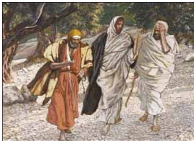
James Tissot, detail from "Pilgrims on the Road to Emmaus"