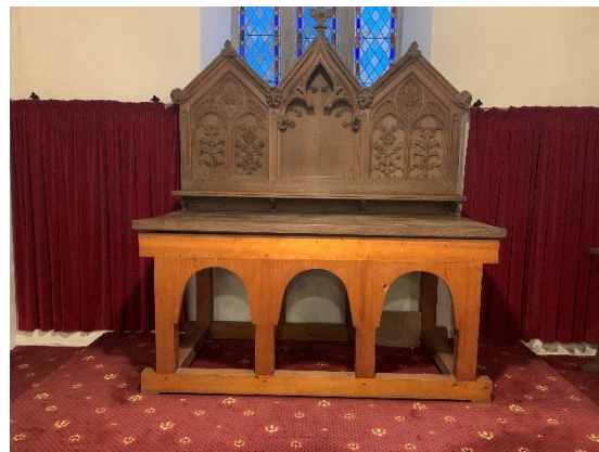
Maundy Thursday at St Giles