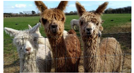
West Wight Alpacas

Three services across our most rural parishes meant an early start and a car boot full of everything from service sheets to spare towels (which proved to be a wise addition). There is something quietly holy about driving along empty lanes Easter morning, rehearsing Alleluias in your head while alpacas watch me pass with mild suspicion. By the time the first "Alleluia, Christ is risen!" rang out inside, the churches were fuller than they had been for some time.