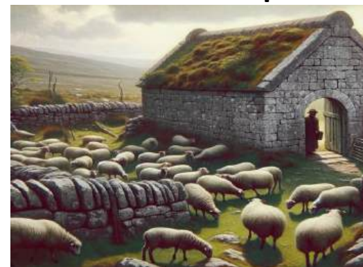
Bible Art, an AI-powered image generation application