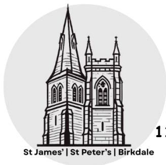
St James' | St Peter's | Birkdale

Bible Reading: John 15:1-8 & Colossians 2:6-7