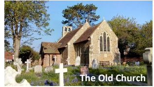
The Old Church

Monday 13 th RNID 'Hear to Help' 11am Weekly Prayer Meeting 7:30pm Wednesday 15 th Wednesday Group 10am Wednesday Holy Communion 11am WoW: 'Simply at Home' 3pm Volunteer Meeting 7pm Thursday 16 th Smallsorts 10am Knit & Natter 1:30pm Friday 17 th Coffee Morning 10am Choir Practice 6pm Saturday 18 th Pre-Marriage Course (1) 6pm Pre-Marriage Course (2) 10am