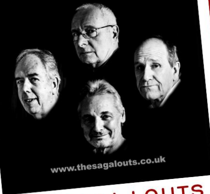
THE SAGA LOUTS 7-8PM