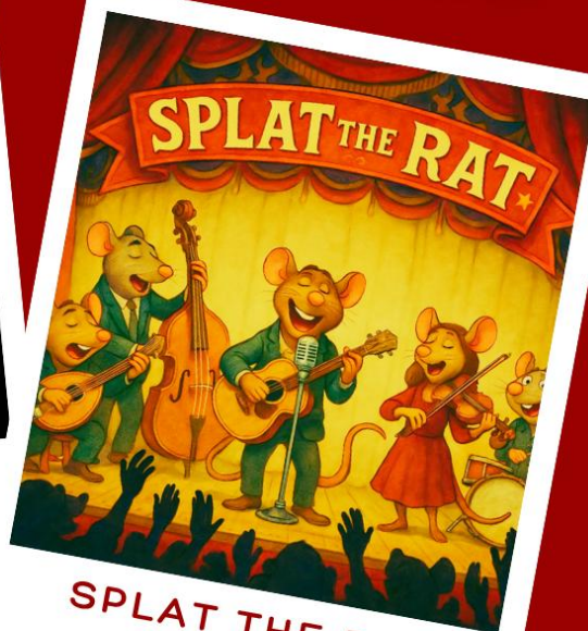
SPLAT THE RAT 8:30-10PM