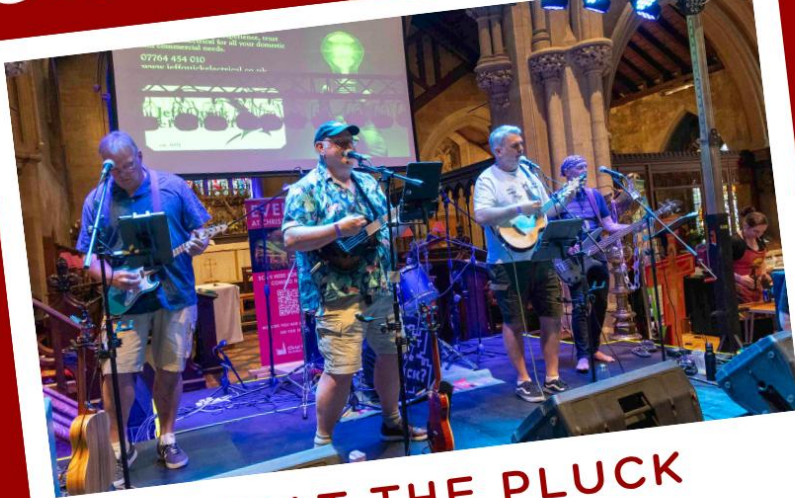
WHAT THE PLUCK 5-6:30PM