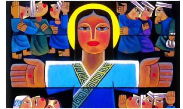
"The Risen Lord" by artist He Q i(2013)