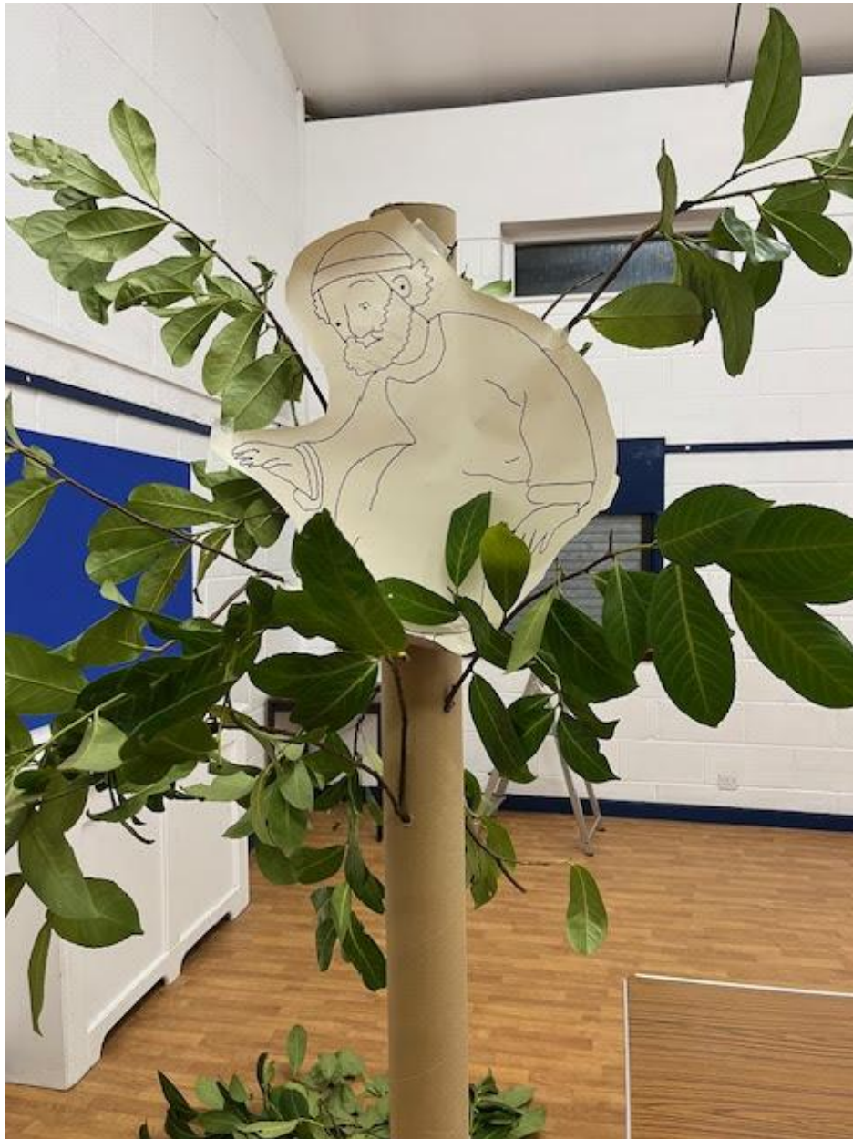
Mini-Zacchaeus contemplating climbing the tree to see Jesus.

Messy Church in January focused on the story of Zacchaeus, including making a tree complete with Zacchaeus perching in the branches.