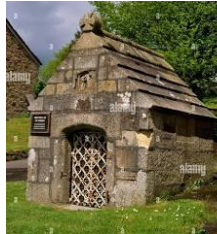
Guron's well outside the church at Bodmin.

Guron was probably educated at Llantwit Major in south Wales, sometime in the 6 th century. That was a centre of Christian training at the time founded by Illytd, and produced many who influenced the church in these islands over the years. Guron was one of those.