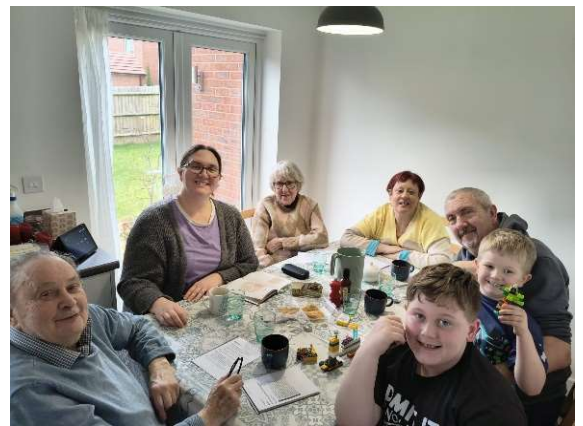
Eating Together with friends