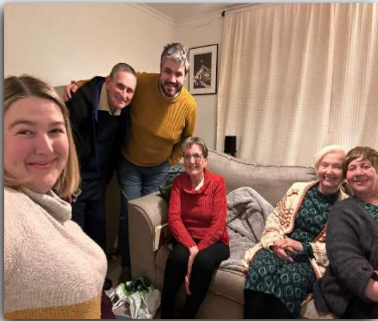
Relaxing before or after?