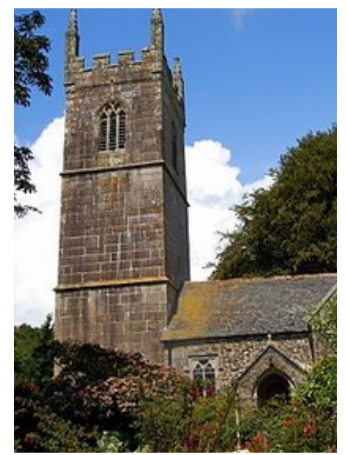
ST ANTHONY TR12 6JW

In aid of the Cornwall Historic Churches Trust