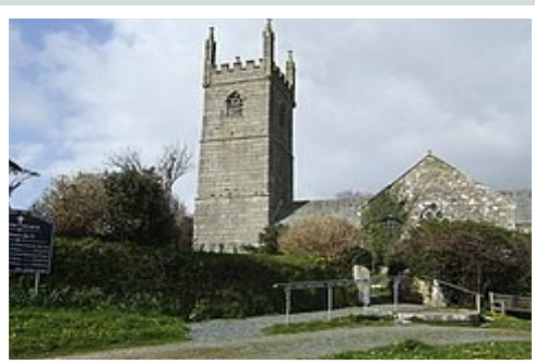
ST MAWGAN TR12 6AD