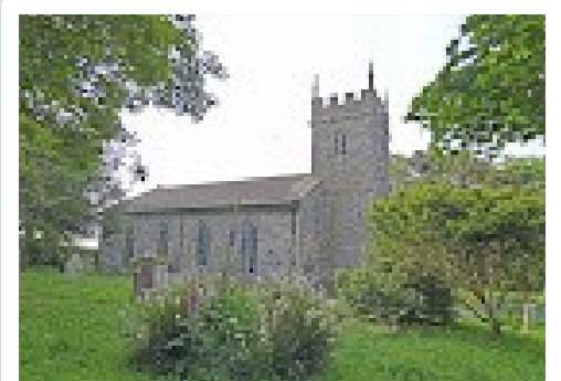
*ST MARTIN TR12 6BT 10am-2pm