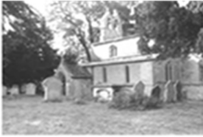
All Saints, Little Ca sterton