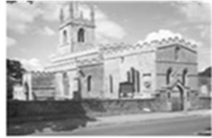
St Peter & St Paul, Great Ca sterton