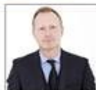
Carl Mean Dip FD, MBIE