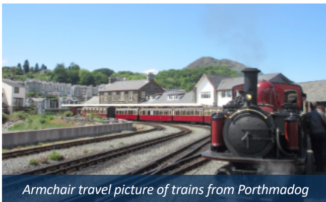
Armchair travel picture of trains from Porthmadog

At the other end of the town, adjacent to the mainline station, the Welsh Highland Heritage Railway will entertain you with a short there and back steam train ride to Pen y Mount and a Museum visit.