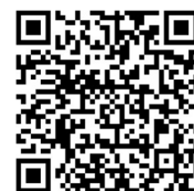
All Saints Murston