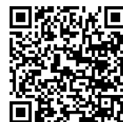
St Laurence Bapchild