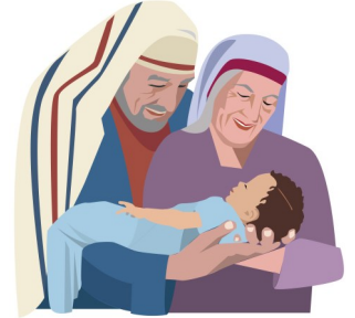
Simeon & Anna See Jesus

If you're new or visiting, please introduce yourself to us, we'd love to welcome you to our church.