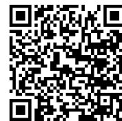
St Laurence Bapchild