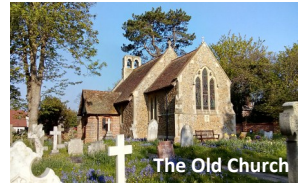
The Old Church