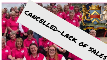
by Border Belles Ladies Choir

7.00pm Saturday January 31st at St. Mary's Priory Church, Monmouth Tel: 07782 509219