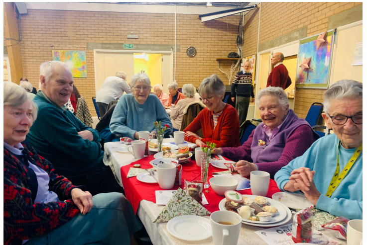
Sharing a joke at 'Tea at Three'!

Tea at Three at St William's on the third Monday of each month at 3pm . Next date: 16 February .