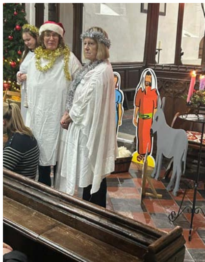
Nativity Service - 24th December