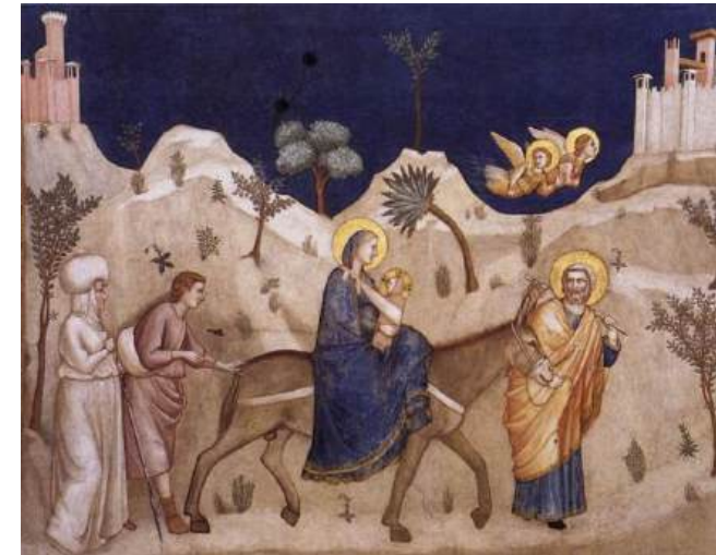
The Flight into Egypt - Fresco by Giotto (1266-1337)