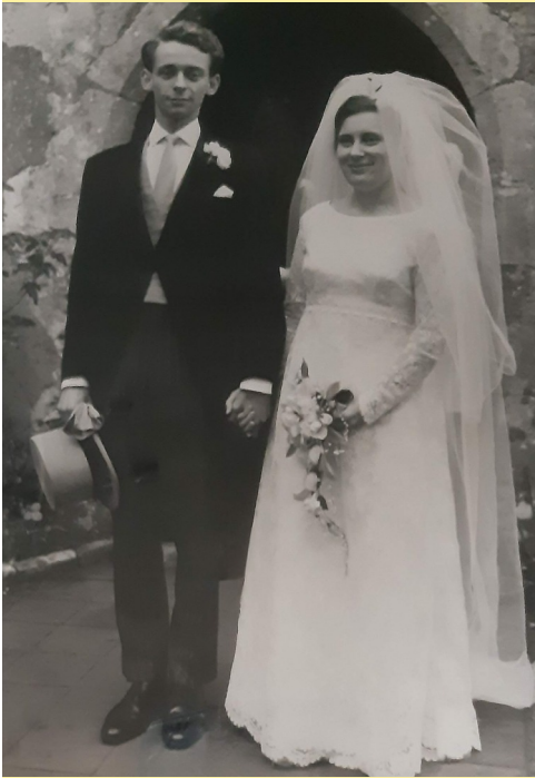
May 21st 1969 Brockenhurst