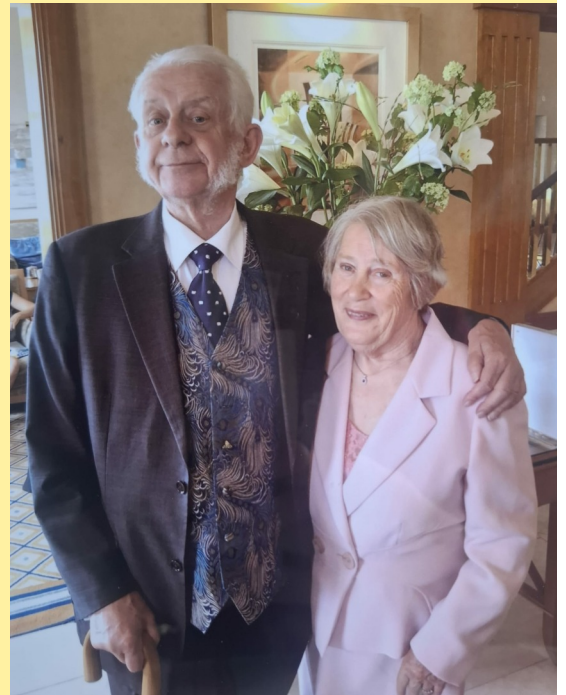
May 21st 2019 Roslin