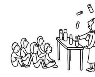
CHILDREN'S TALKS BASED LARGELY AROUND TOILETRY GIFT SETS