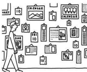
A FESTIVAL OF CALENDARS