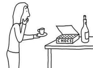
TREATS AT THE COFFEE MORNING