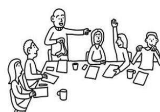
PRIZES AT P.C.C MEETINGS