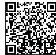
Brightwell PCC QR Code