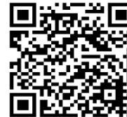
Martlesham PCC QR Code