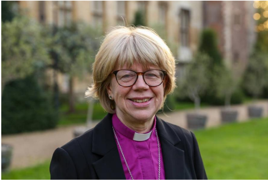
The new Archbishop of Canterbury, The Rt Hon Dame Sarah Mullally DBE (presently Bishop of London)

Almighty and everlasting God, the only worker of great marvels, send down upon your servant Sarah, called to be Archbishop of Canterbury and all who are committed to her care, the spirit of your saving grace, and that they may truly please you, pour upon them the continual dew of your blessing. Grant this, O Lord, for the honour of our advocate and mediator, Jesus Christ. Amen.