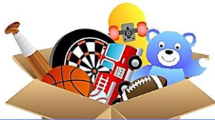
TABLE TOP AND CARBOOT SALE