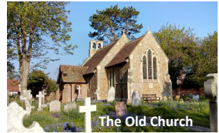
The Old Church