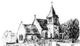
St Peter's, East Tytherley