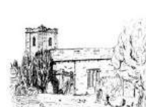
St Peter's, West Tytherley