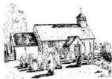
St Winfrith's, East Dean