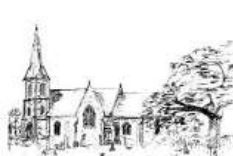
St John's, Lockerley