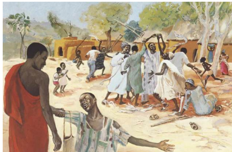
"Healing of the ten lepers" Jesus Mafa 1973