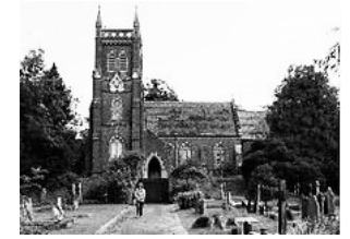
St Mary's, Collaton St Mary

5th October 2025 Sixteenth Sunday after Trinity