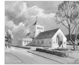
St George's, Goodrington