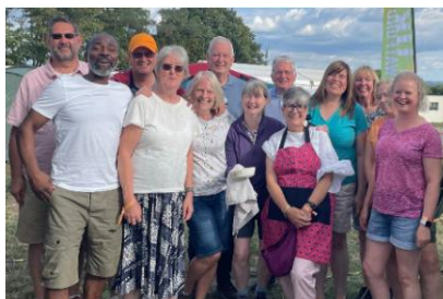
Our fellow 'campers' from St Luke's

more. It was about hearing God speak in ways that felt personal, challenging and timely. Other members of the group were 'up with the larks' and attending the early morning Rise session at 7:15am – returning to their hotels for breakfast afterwards!