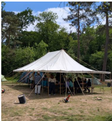
Group Camp and AGM

Of course, none of this works without people. We're always looking for more adult volunteers to help lead our sections, whether that's weekly support or occasional assistance on trips. If you've ever thought about getting involved, now's a great time to give it a try. There's nothing quite like