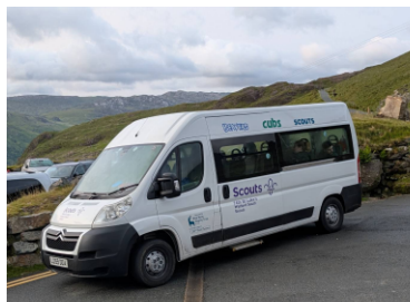
Our newly refurbished minibus which gets us around and is loaned out to other uniformed groups