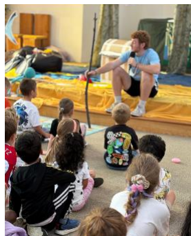
Bible teaching through drama

We had the privilege of again running a four-day summer holiday club, 5th–8th August, with the highest ever attendance of 75 children. This year's theme was 'Deep Sea Divers' based on material produced by Scripture Union. We focused on Matthew's Gospel to help the children learn more about who Jesus is. Over the course of four days, we dived into different Bible stories from Matthew, including the birth and baptism of Jesus, the healing of a man who could not walk, Jesus walking on water, the crucifixion and the resurrection.