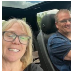
Setting off — excited and a little apprehensive

There's a unique thrill when stepping into something completely new — especially when it's a gathering of thousands united by worship, fellowship and a shared love for God's presence. For us, this summer's adventure took the form of our very first visit to the New Wine Festival at the Bath and West Showground near Shepton Mallet, 30th July-4th August. We have been to other Christian festivals but not for many years when our children were quite small.