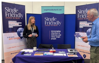
SFCN stand at the Church of England Synod.

Since the beginning of 2025, St Luke's has begun the journey towards becoming a single friendly church. One of our priorities is to create a strong sense of family among the congregation at St Luke's. This notion is upheld throughout the Bible and was what Jesus intended for His church. Matthew 12:50 says "For whoever does the will of my Father in heaven is my brother and sister and mother" and 1 John 3:1 calls us "children of God". God intends the people in His church to be a family to one another.