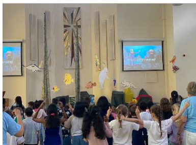
Worship through action songs

It was great to see the children's enjoyment throughout the week and to receive positive feedback from parents. The entire time was an incredible opportunity to connect with so many children and share the message of Jesus with them. We are praying that the children will continue to seek to learn more about Jesus and that we can build on the connections we have with their families.