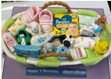
The stunning cake made by Tapestry Cakes