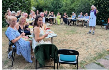
Wine-tasting evening in the Vicarage garden