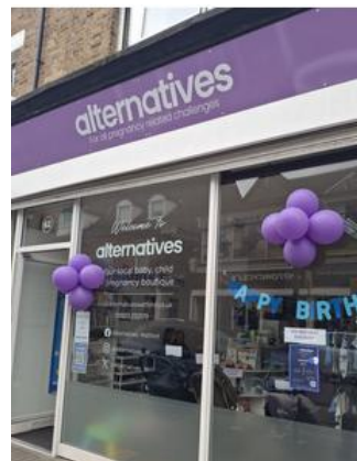
Our shop in Queens Road

Are you looking for something impactful and meaningful to do with your time? We need more volunteers in both of our shops in Watford and Hemel Hempstead to assist