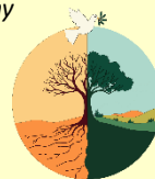
Garden of Peace Isaiah 32:14-18

COLLECT (Creationtide) Trinity 13 Almighty God, you have broken the tyranny of sin and have sent the Spirit of your Son into our hearts, whereby we call you Father: give us grace to dedicate our freedom to your service, that we and all creation may be brought to the glorious liberty of the children of God; through Jesus Christ your Son our Lord, who is alive and reigns with you, in the unity of the Holy Spirit, one God, now and for ever.