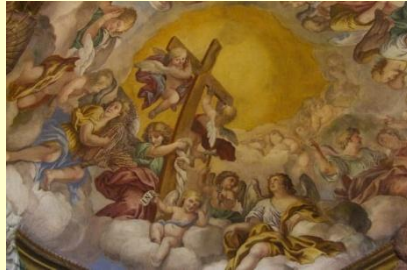
Holy Cross Day

TWO WEEKS - SUNDAYS 14 th & 21 st September 2025