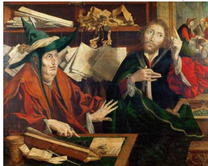
The Parable of The Unjust Steward, c1540 Painting Marinus Van Reymerswaele