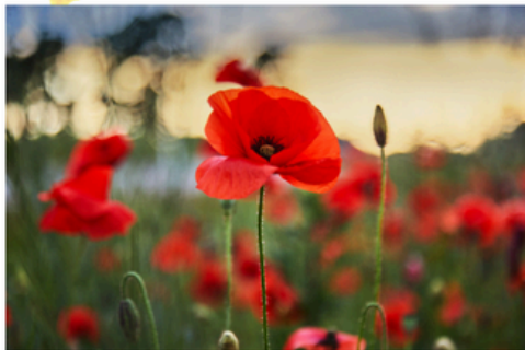
Remembrance 9 th November