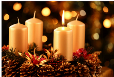
Advent 30 th November Christmas Celebrations