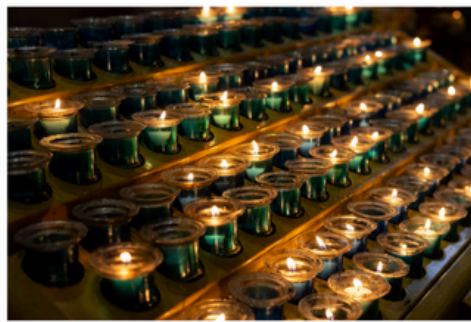
1. Festival of Remembrance 26th October

St. Michael's 5 th Oct 9.30am St. Andrew's 12 th Oct 11.00am St. Thomas' 19 th Oct 9.30am