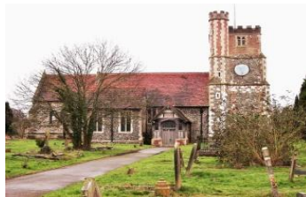
St. Michael's Church Horton