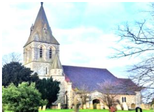
St. Andrew's Church Wraysbury