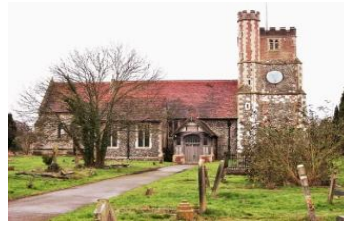
St. Michael's Church Horton