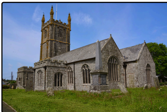
St. Breaca Church, Breage