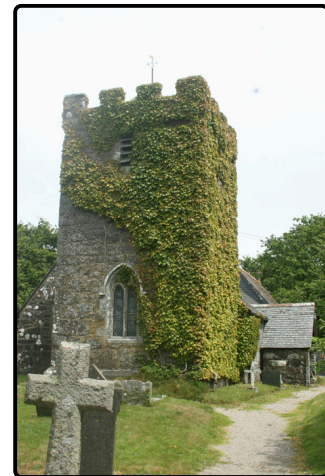
St. Ruan Church, Ruan Minor