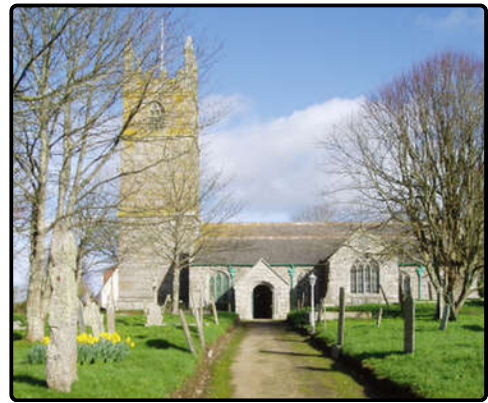
St. Sithney Church