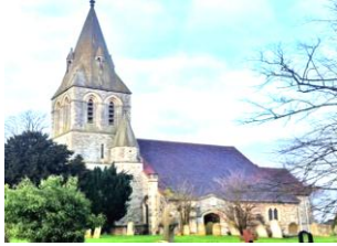
St. Andrew's Church Wraysbury