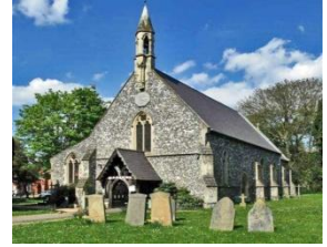
St. Thomas' Church Colnbrook