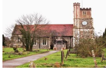
St. Michael's Church Horton