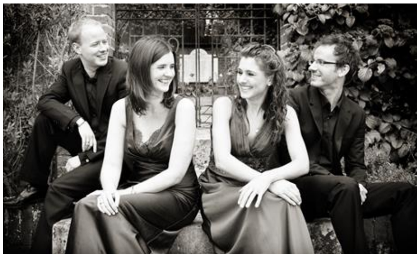
The Carducci Quartet

Box Office 01923 265386 www.sarrattfestivalofmusic.co.uk