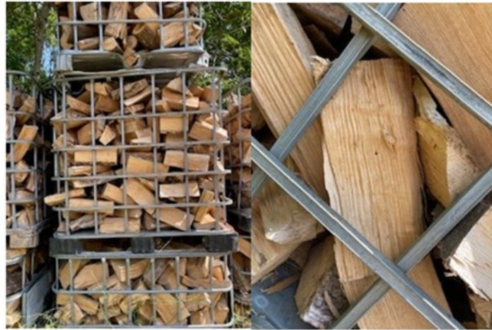
1m 3 in Crate

Free delivery (locally) in 1 m 3 containers (£180) or loose (c. 1.75 m 3 ) for £240