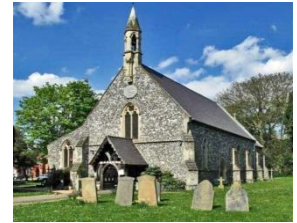
St. Thomas' Church Colnbrook