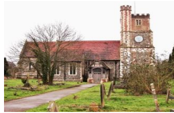
St. Michael's Church Horton