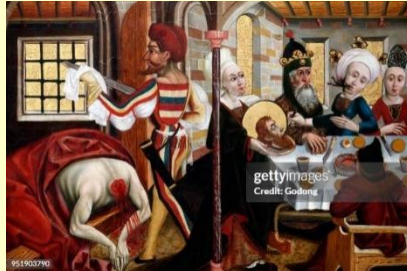
Beheading of John the Baptist 29 th August

TWO WEEKS - SUNDAYS 17 th & 24 th August 2025