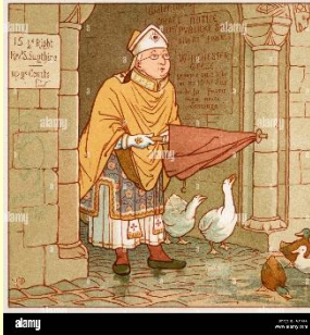
St Swithun - 15th July

TWO WEEKS - SUNDAYS 6 th & 13 th July 2025