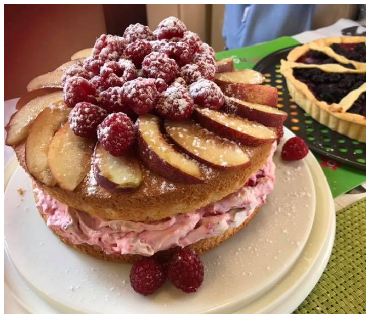
One of Caroline's Culinary Creations (Parish Coffee Morning 2019)

Do you have a favourite holiday destination? Cornwall.