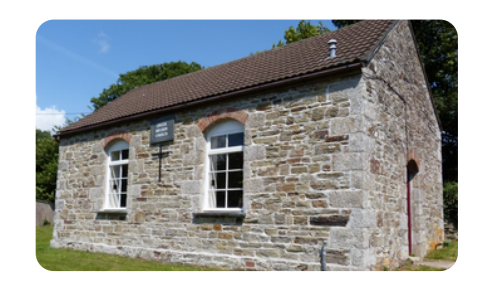
Gweek Mission Church