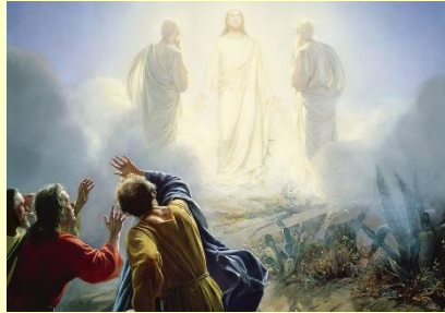
Feast of the Transfiguration of Our Lord 6 th August

TWO WEEKS - SUNDAYS 3 rd & 10 th August 2025