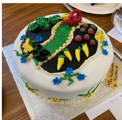
Celebration Cake: "The Sustainable Garden"