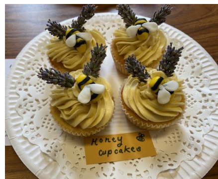
Honey Cupcakes (with bees!)