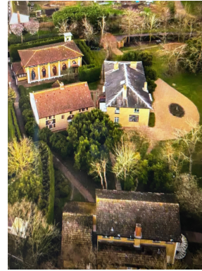
Kelvedon Institute (small hall) Saturday 26th July 3-4.30pm